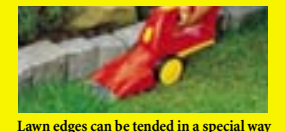
Lawn edges can be tended in a special way