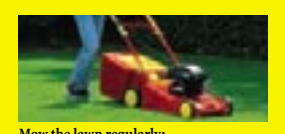
Mow the lawn regularly: ideal height:

The lawn of your dreams – The result of simple and regular care