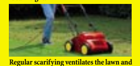
Regular scarifying ventilates the lawn and suppresses the formation of moss and weeds