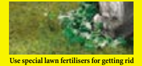
Use special lawn fertilisers for getting rid of moss and weeds