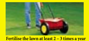
Fertilise the lawn at least 2 - 3 times a year